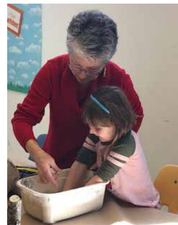
Creative Explorers Chatham Cultural Council