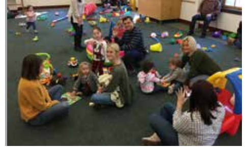
Toddler Town Brewster Ladies Library