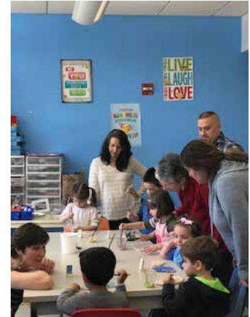
Parent & Children Activities