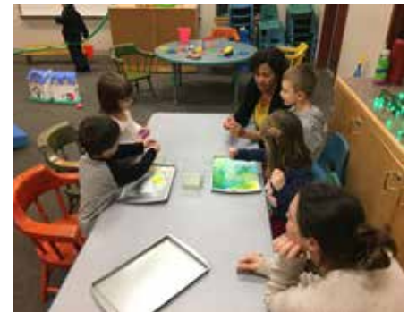
Sensational Kids Sensory, Pajama Play Group