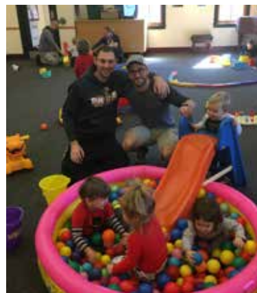
Toddler Town Brewster Ladies Library