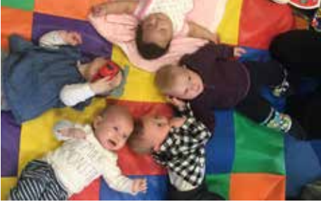
Baby's First Year Group Snow Library, Orleans