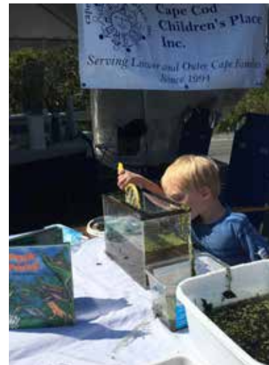
Celebrating Our Waters Orleans