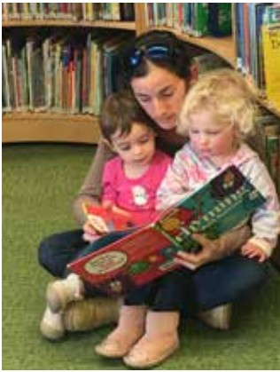
Read & Play