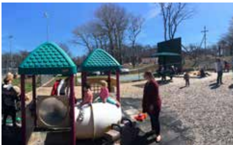
Playground Playgroup Eldredge Park Playground