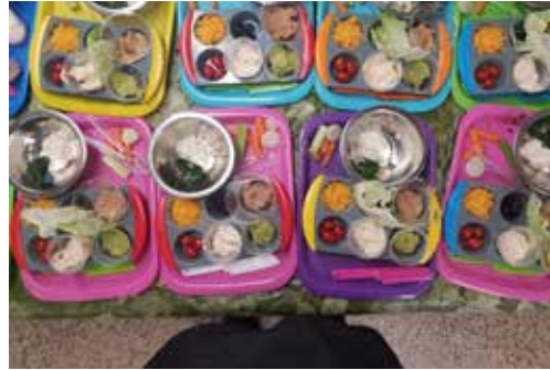
Nutrition & Healthy Eating Workshops