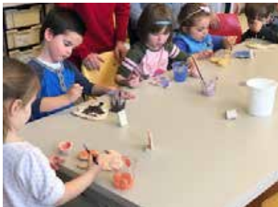
Little Artists Provincetown Collaboration with PAAM