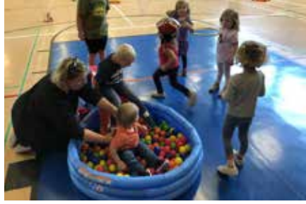
Open Gym & Playroom Playtime Harwich Community Center